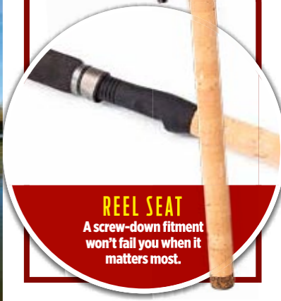
REEL SEAT A screw-down fitment won't fall you when it matters most.