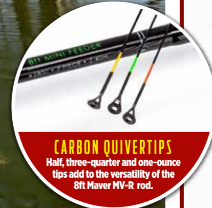
CARBON QUIVERTIPS Half, three-quarter and one-ounce tips add to the versatility of the 8ft Maver MV-R rod.