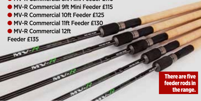
There are five feeder rods in the range.

AnglingTimes TESTED ON-THE-BANK MAVER MV-R 8FT MINI FEEDER